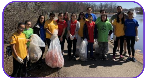
Five Leader Club members and Togetherhood volunteers clean up Papaiani Lake

On Sunday, April 22 nd , volunteers from the Edison and Metuchen YMCA branches had volunteers at the 8th Annual Edison Earth Day Celebration, intended to inspire awareness and appreciation for the Earth's natural environment. The Metuchen Teen Leaders Club joined forces with the Togetherhood volunteer group to help clean up Papaiani Lake, walking around the lake to pick up litter and then enjoying Italian ices and some laughs together! By talking and