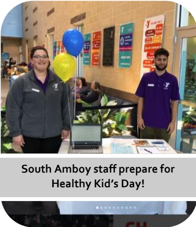
South Amboy staff prepare for Healthy Kid's Day!