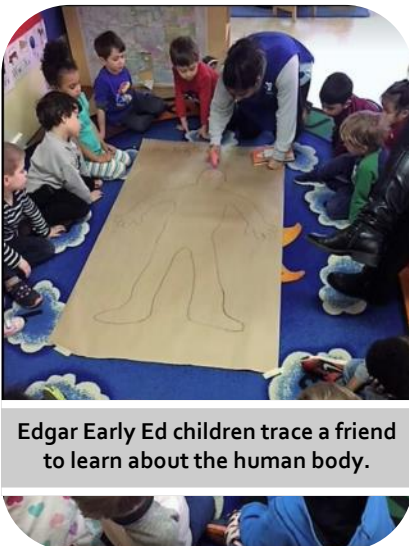
Edgar Early Ed children trace a friend to learn about the human body.