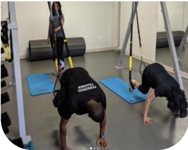
New TRX classes at Edison are a huge success!