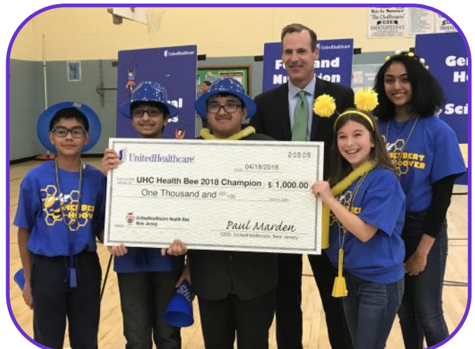
Students from the winning school, Herbert Hoover, proudly display their $1,000 check