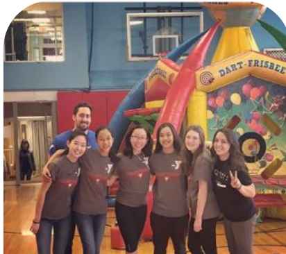
Metuchen staff and Leaders Club get ready to celebrate Healthy Kids Day!