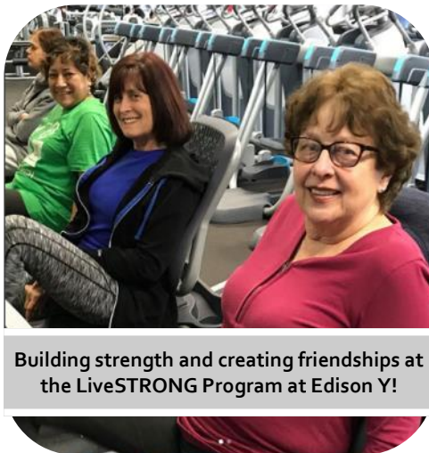
Building strength and creating friendships at the LiveSTRONG Program at Edison Y!