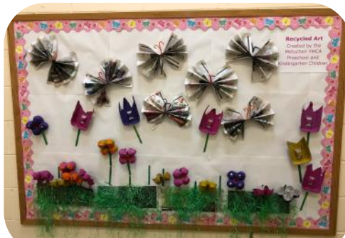
Metuchen Kindergarten and Pre-School Children Create Recycled Art