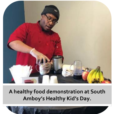
A healthy food demonstration at South Amboy's Healthy Kid's Day.