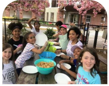
Metuchen kids celebrate Cinco de Mayo by making guacamole and mango salsa.